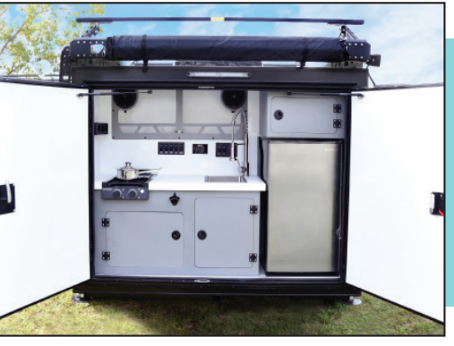
An unmatched kitchen and a largest in-class 43-gallon freshwater tank are just a few features that make the 12RK stand out!