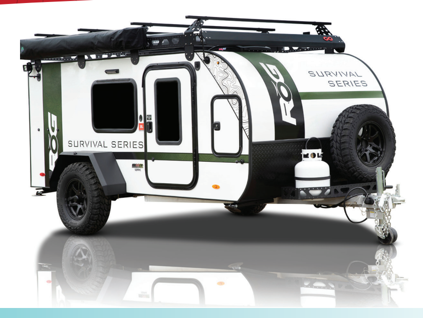
The Survival Series isn't just tough "looking", it's tough performing!